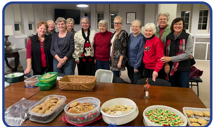
L.I.F.T. Cookie Exchange